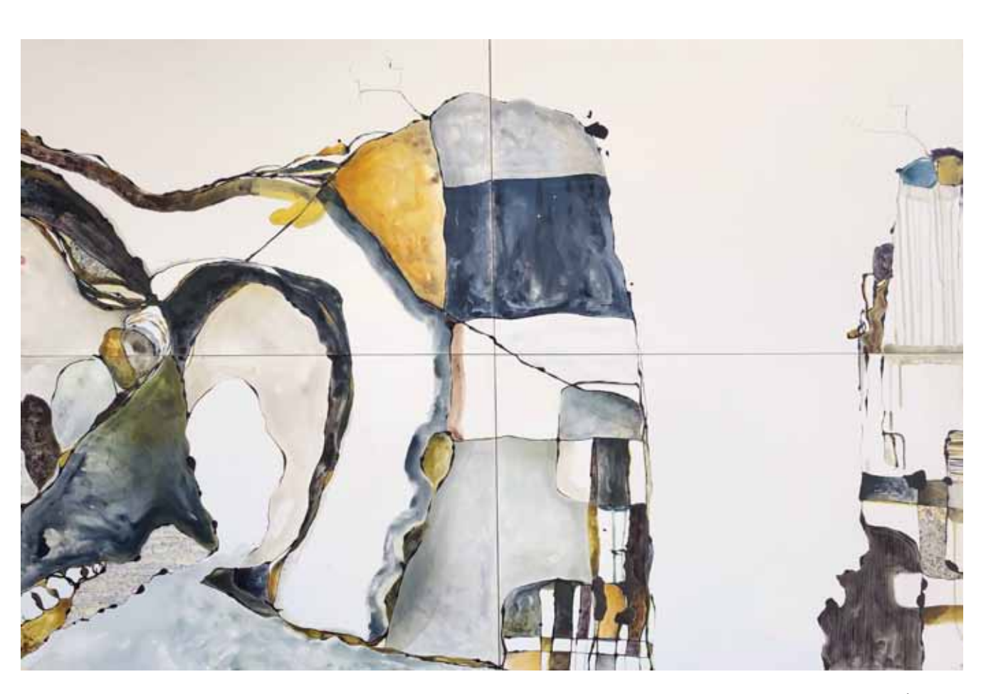
I'm Going North - Watercolour, Ink & Acrylic on Clayboard- Framed - 140x140cm -$4295